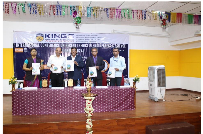
Release of Conference Proceedings