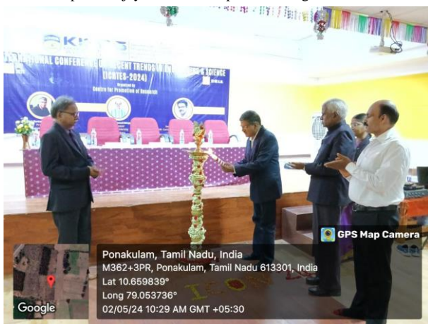
Dignitaries lighting the Lamp