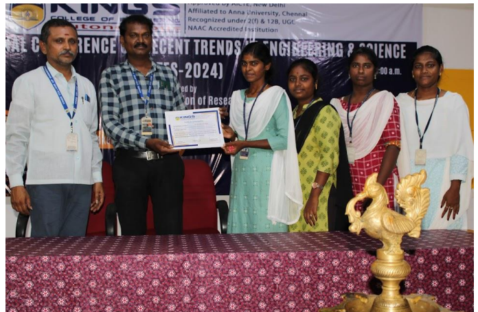
HoD's distributing certificates to the participants