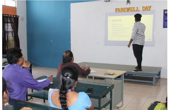
Participant presentation their papers