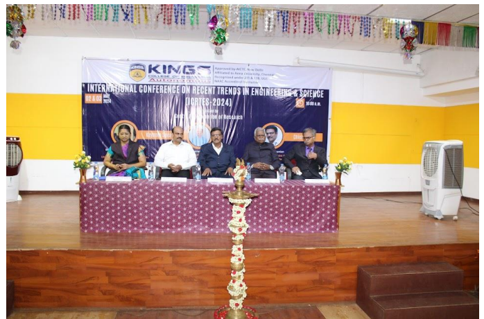
Dignitaries on the Dias