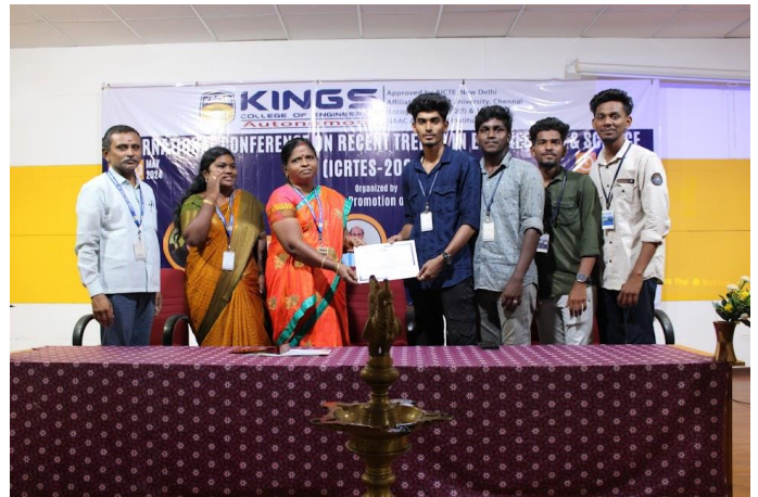
HoD's distributing certificates to the participants